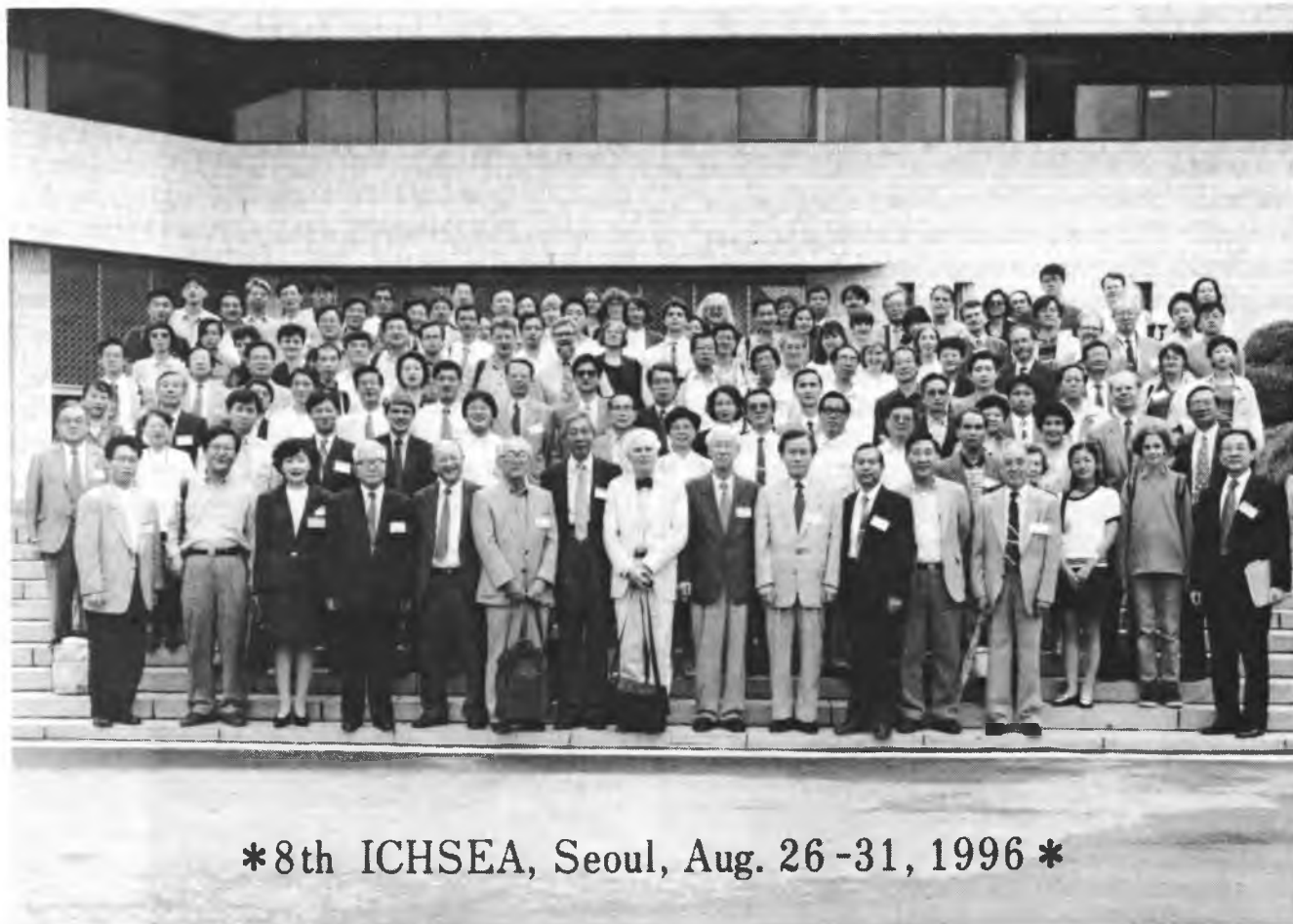
*8th ICHSEA, Seoul, Aug. 26 -31, 1996 *